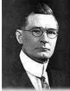
W. D. Gann (1878-1955)