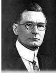
W. D. Gann (1878-1955)